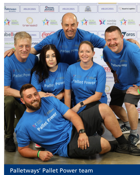
Palletways' Pallet Power team

"We competed in a series of physical, practical and mental team challenges which tested everyone's teamwork, collaboration and encouragement of each other, which ultimately celebrated the differences in us all in a fun and informal way."