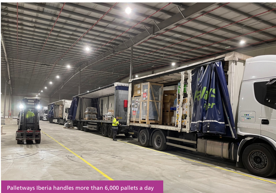
Palletways Iberia handles more than 6,000 pallets a day