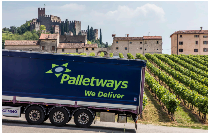
Palletways Italy has supported Cinemadivino for nine years

This was another opportunity for Palletways Italy to show its support to the segment that accounts for 30 per cent of its volumes. The network works with wine producers every day who choose Palletways' services, in particular Palletwaysonline and Pallets to Consumers - tailored for customers who directly interact with end consumers - to distribute their products safely and reliably throughout Italy and Europe.