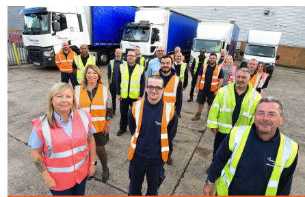
The Palletways Milton Keynes team